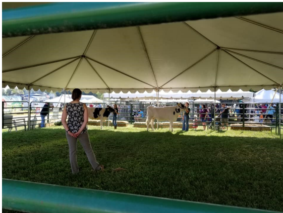
Dairy Show 2019

The Goochland Extension Office had a great weekend at Field Day of the Past 2019. The Goochland 4-H Livestock show had 25 Youth participants with over 100 show & exhibit animals. 4-H kids, parents, volunteers and staff of the Virginia Cooperative Extension - Goochland County office put on a great exhibit! For more information about Field Day of the Past, please visit their website at www.fielddayofthepast.net or check out their Facebook page for more updates about this years event.