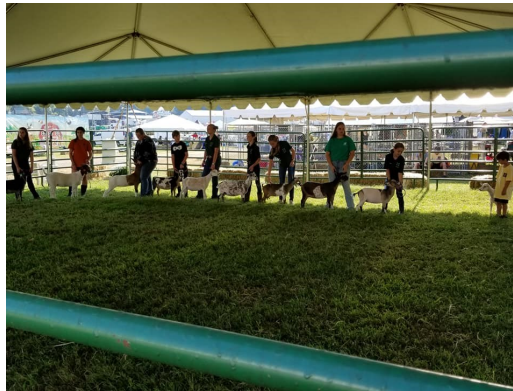
Goat Show 2019