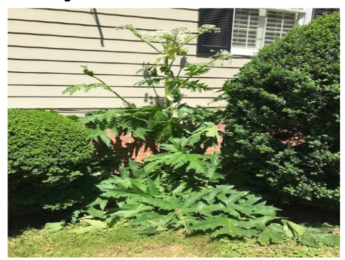
Giant hogweed guide will help identify and control this dangerous plant in Virginia

Anyone who suspects they have located giant hogweed should be encouraged to contact the Virginia Department of Agriculture and Consumer Services or their extension agent.