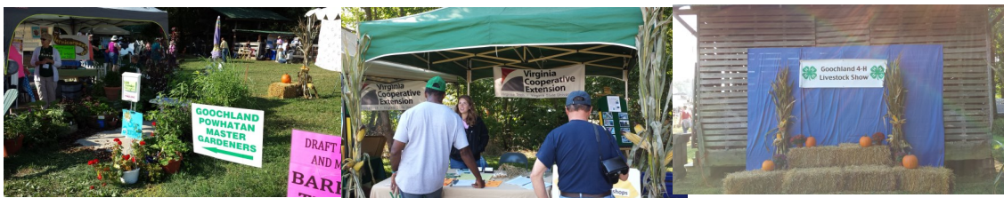
Photos of the Goochland Powhatan Master Gardeners/ Extension Office/4-H display at Field Day of the Past 2014.

Come and watch the Goochland 4-H Livestock show and see the hard work that the 4-H kids, parents, volunteers and staff of the Virginia Cooperative Extension - Goochland County office put into making a great exhibit! Hope to see you there! For more information about Field Day of the Past, please visit their website at www.fielddayofthepast.net or check out their Facebook page for more updates about this years event.