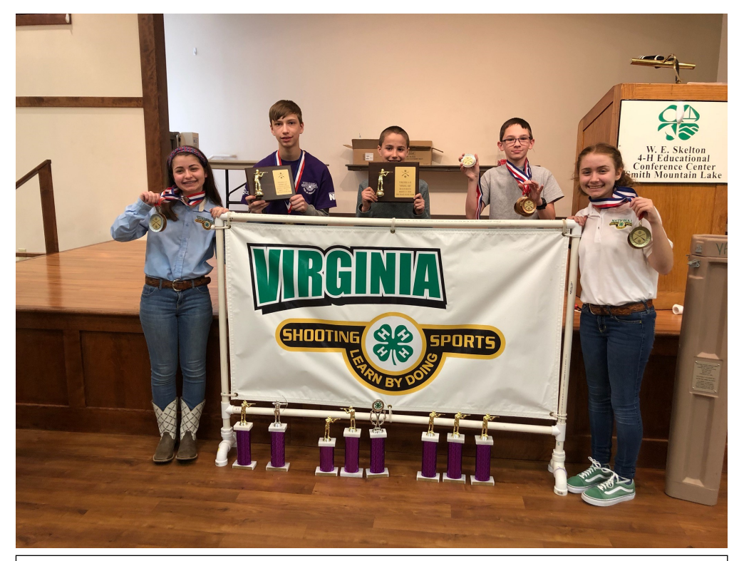
The Goochland Shooting Education Club after Spring Air weekend March 16-18, 2019.

Top: Goochland Shooting Education Club Spring Air Competition Bottom: Goochland County & District Photography Contest Winners